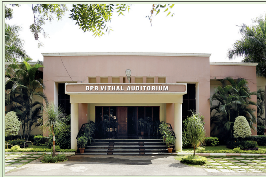
To perpetuate the memory of its founder, the Centres' Auditorium has been named after him