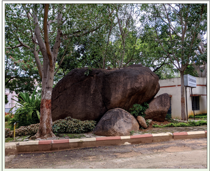
The Rock that he zealously protected (from blasting and removal) in the Centre's premises