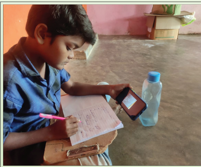
A school boy of 8th class attending an online class through a mobile device

The rapid phone survey was conducted in May 2020 during the Covid-19 lockdown for assessing the socio-economic impacts of lockdown on informal workers. 91 informal workers from five districts were interviewed. The lockdown exposed the vulnerability of informal workers to sudden income shocks. The adverse impacts of the lockdown on informal workers include: loss of employment (77%); severe cash crunch; reduction in food consumption (67%); borrowing money to meet food requirements (33%); housing deprivation caused by relocation to temporary shelters provided by the employers (migrant workers); inability to pay house rents; and non-compliance by the employers/landlords with the government's directives regarding payment of full wages and deferment of rent collection. As for migrant workers, they were confronted with various hardships such as the inability to send remittances to their families, a sense of desperation to return to their native places, trauma, emotional stress and helplessness.