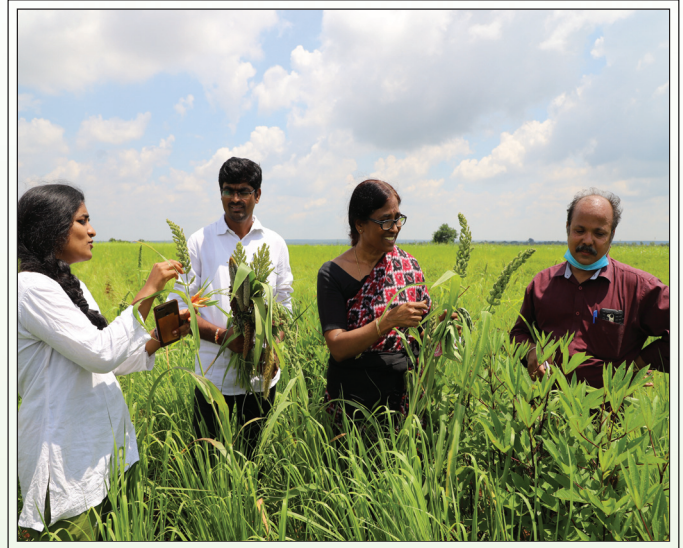
Field visit to Biodiversity based millet farms in Lacchanaik Thanda of Zaheerabad Mandal on September 9, 2020

The empirical study endeavoured to assess the impact of the STSDF of Telangana. The study covered 413 beneficiary households spread across 167 villages of 10 districts with scheduled areas. The study assessed 15 schemes implemented by both the nodal Department and line Departments, in addition to examining the status and quality of "non-divisible" assets created under the STSDF and the user feedback on them. The study found that the schemes have made significant impact on the beneficiary ST households in the state. However, the following concerns need to be addressed: the Particularly Vulnerable Tribal Groups (PVTGs) lag behind other tribes; coverage of STs under the schemes should be expanded; under subsidy-based schemes (such as the ESS) the total financial support needs to be treated as subsidy (100% subsidy) doing away with the bank loan component of the assistance - particularly for the poor beneficiaries; and the guidelines of different schemes need to be made flexible or customised to the peculiar conditions prevailing in the tribal areas.