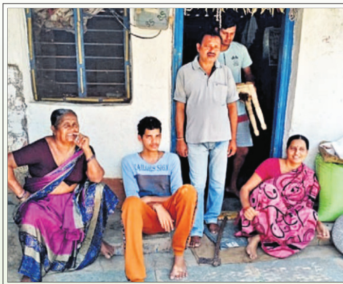
Interview with a Lambada Family in Mulugu District on Impact of Lockdown