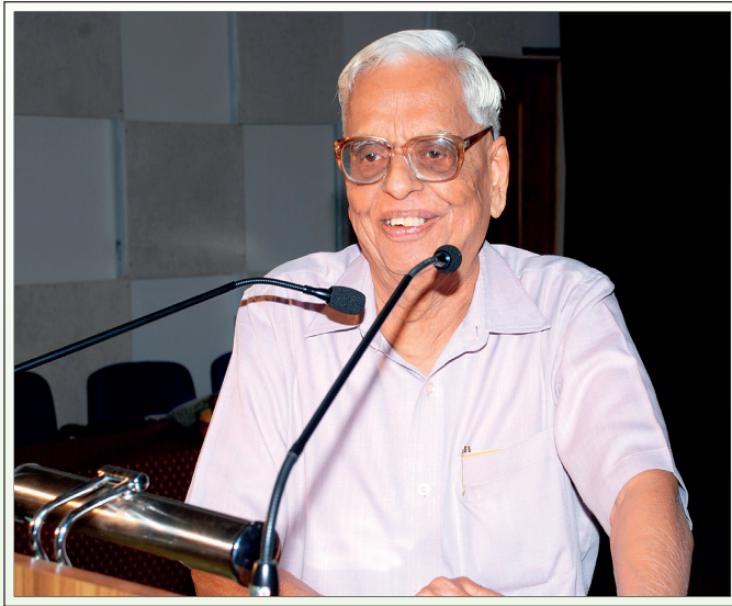
At a function on 22 May 2008