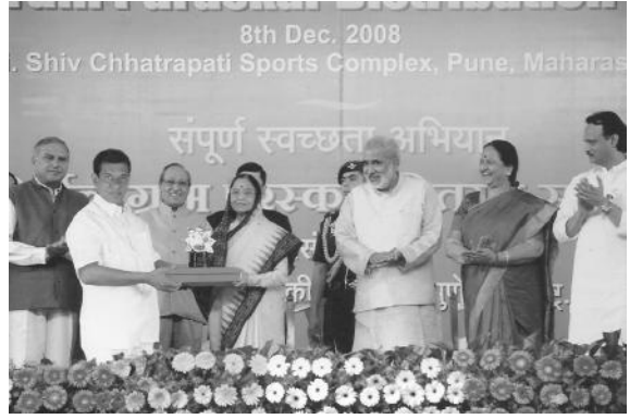
Fig-1: Sarpanch receiving Nirmal Puraskar Award

the tank with water during summer. The water from the tank used to be first filtered in filter beds and then lifted to OHT. From the OHT, the water is distributed to all parts of the village through pipelines. For construction of OHT, GLSR(s) and laying of pipeline Gram Panchayat mobilized Rs. 20 lakhs of funds from Accelerated