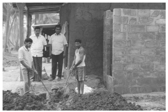
Fig-6: Construction of ISLs with support of Panchayat and Byrraju foundation