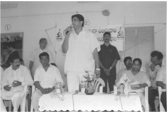
Fig-4: Awarences Programmes on Sanitation

Medical Health Center found that the majority of the diseases were due to consumption of contaminated water. Hence the members of Gram Vikas Committee and Gram Panchayat approached Byrraju Foundation for providing treated drinking water to the people in the village. The Byrraju Foundation suggested that the households