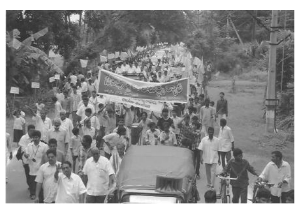
Fig-5: Awarences Programmes on Sanitation

Gram Panchayat mobilized Rs.4.5 lakhs of funds from Collector's special fund. A 10 HP capacity AC Generator was also purchased with the corpus funds panchayat of gram for overcoming the electricity supply problems in providing water continuously. In Magadandi SC colony, which is part of Jakkaram Gram Panchayat, about 20 houses were constructed under Indiramma Housing Scheme. These houses do not have water facility. Hence, pipeline was laid to Magadandi for providing water by maintaining equal pressure. For laying this pipeline Grama Panchayat mobilized funds from RWS (Rs.2.5 lakhs) and Indiramma Housing Scheme (Rs.2.5 Lakhs). Thus they reached to 204 household connections and 18 public stand posts, covering the entire Gram Panchayat.