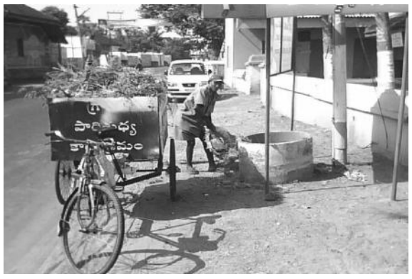
Fig-7: Safe Disposal of Garbage

a monitoring committee in controlling the open defecation.