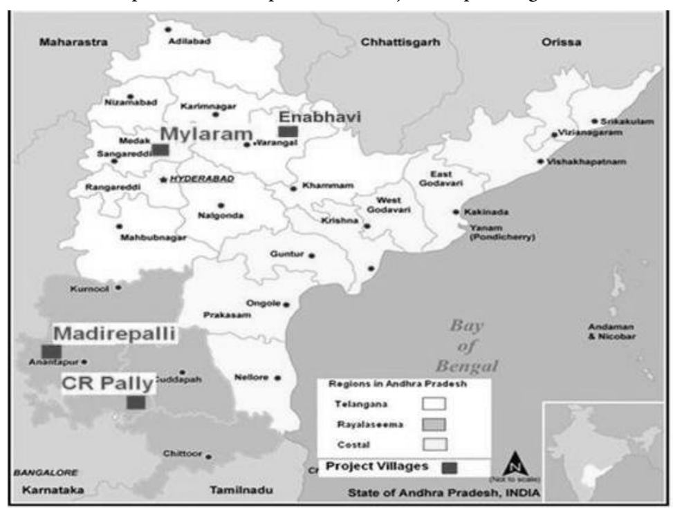
Map 2: Location Map of SRWM Project Sample Villages

Competition between neighbouring farmers often leads them to drill borewells as close as two meters apart. For instance, in Madirepalli Village, three neighbouring farmers dug 13 borewells in an area of 0.5 acres over a period of four years in competition to tap groundwater. The project realized that there is need for changing the mind-set of the farmers from "competition" to "cooperation" and to increase the "water literacy" among the farmers for efficient use of water.