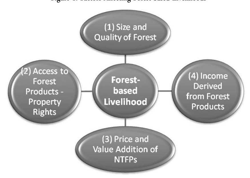
Figure 1: Factors Affecting Forest-based Livelihoods

property rights and reasonable income derived by households from such produce from value addition as well as selling it at reasonable prices. Proper working of institutions and secure property rights encourage the actual users to utilise the resources properly, safeguard the resources, and develop them. Malfunctioning of institutions and unfavourable government policies affect the livelihood of local population adversely (Sarap & Sarangi, 2009 & 2010b).