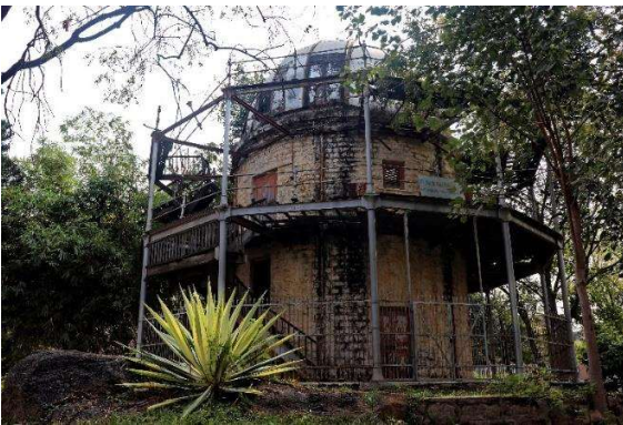
Iconic Nizamiah Observatory at CESS