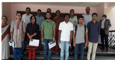
New batch 2020-21 with DGS