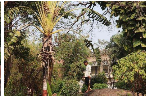
The Guardians of 'beauty of CESS'