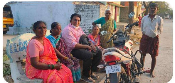
Researchers on their field work.