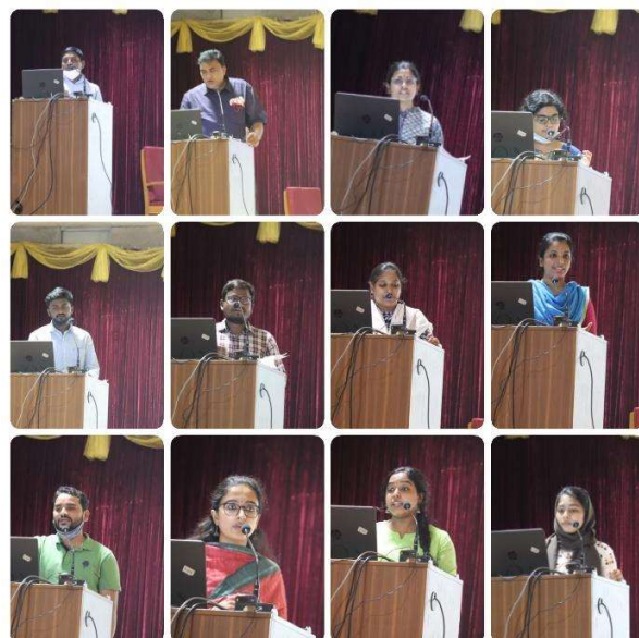
Scholars' presenting at the event of "Impact of COVID 19 on the economy."