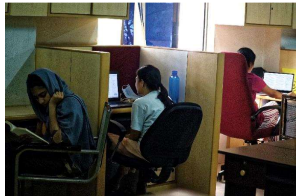
Scholar's study room at CESS