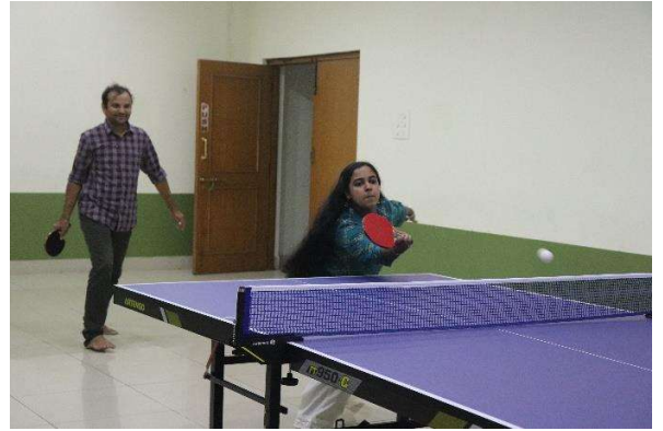
Table Tennis at CESS